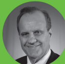
Joe Torre Hall of Fame Baseball Manager

To be the best leader of others, you first must to lead yourself well. Attend Leadercast Live to learn from world-renowned experts about the qualities and characteristics of global leaders who exemplify what it means to lead yourself.