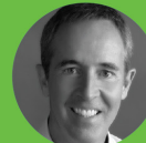
Andy Stanley Leadership Communicator & Bestselling Author