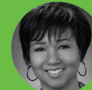
Mae Jemison NASA Astronaut, Engineer & Physician