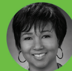
Mae Jemison NASA Astronaut, Engineer & Physician