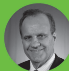
Joe Torre Hall of Fame Baseball Manager

To be the best leader of others, you first must learn to lead yourself. Learn from these global leaders who exemplify the best of what that means. You'll leave a better leader.