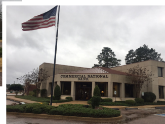
Right: Commercial National Bank, Texarkana, TX

Commercial National Bank has multiple branches in our community, which means their commitment to looking good lifts up business neighborhoods on both sides of the stateline.