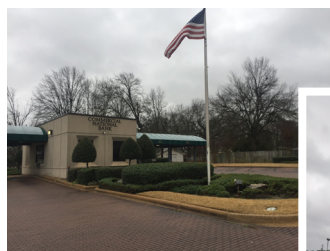
Left: Commercial National Bank, Texarkana, AR