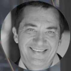
Dr. Henry Cloud Leadership Expert, Psychologist & Best-Selling Author