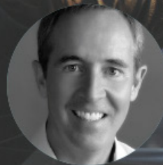
Andy Stanley Leadership Author & Communicator