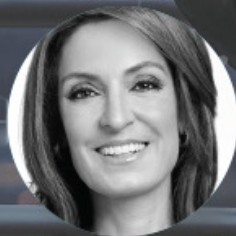
Suzy Welch Author, TV Commentator & Business Journalist