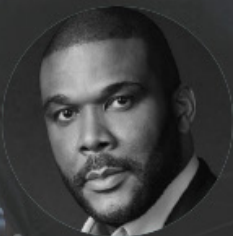
Tyler Perry Director, Playwright, Screenwriter, Producer, Actor, Author & Entrepreneur