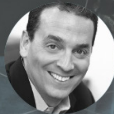
Daniel Pink Behavioral Science Expert, Author & Host of Crowd Control