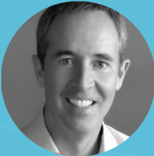
Andy Stanley Leadership Author and Communicator