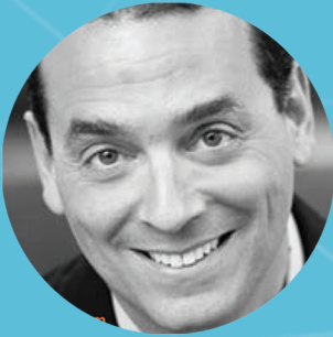
Daniel Pink Behavioral Science Expert, Best-Selling Author, and Host of Crowd Control

Leadership wisdom simulcast live around the globe to over 100,000 leaders like YOU in communities like OURS. in partnership with TISD and Texarkana College Promotional partner Txk Chamber of Commerce