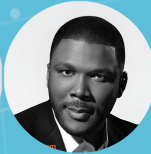
Tyler Perry Director, Playwright, Screenwriter, Producer, Actor, Author, & Entrepreneur