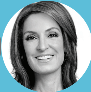
Suzy Welch Author, TV Commentator, and Business Journalist