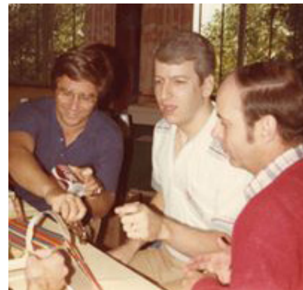
Leadership Texarkana Class of 1981